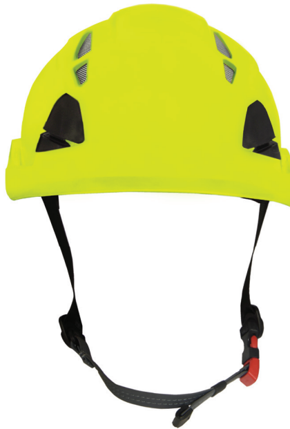
(Front with Chin Strap)