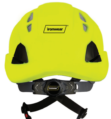
(Back with Ratchet)